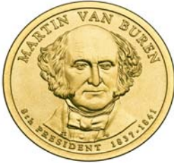
Martin Van Buren $1 Coin

First Quarter Fiscal Year (FY) 2009 Financials: FY 2009 first quarter total revenue increased 29 percent from the same quarter last year. Circulating revenue decreased by 13 percent, and numismatic revenue decreased by 36 percent, while bullion revenue increased by 279 percent compared to first quarter FY 2008 revenues.