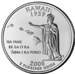
Hawaii Commemorative Quarter-Dollar Coin

Presidential $1 Coin Act: The eighth coin in the Presidential $1 Coin Program honors President Martin Van Buren and was released to the general public on November 13, 2008. Shipments of the Martin Van Buren $1 Coin to the Federal Reserve Bank totaled 90.5 million coins at the close of the first quarter of FY 2009.